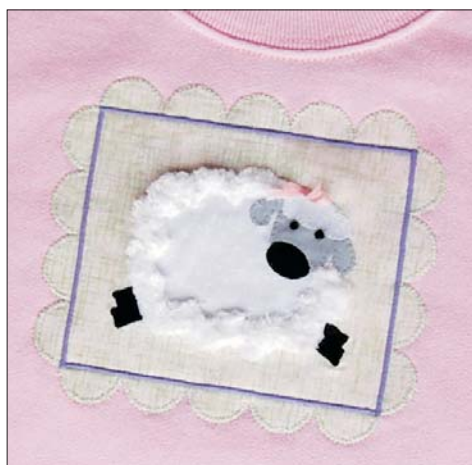
Finished Design Size: 5" x 6"